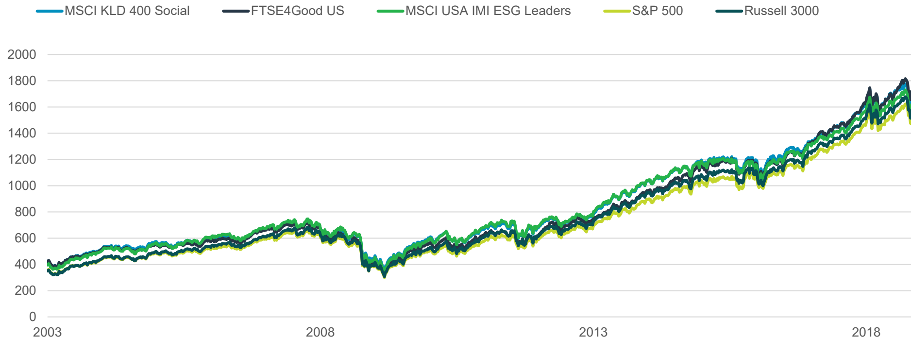
Cumulative returns of three U.S. RI indexes vs. S&P 500 and Russell 3000 indexes (2003-2018)

RI performance over time shows comparable to broad market benchmarks